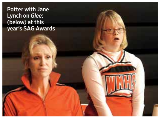
Potter with Jane Lynch on Glee ; (below) at this year's SAG Awards